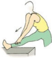
Standing hamstring stretch